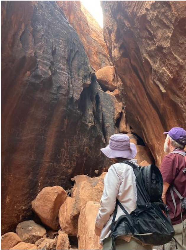
Gold Butte - Kirk's Grotto