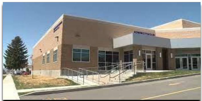
Beaver High School 195 E Beaver Boulevard

A little about Beaver: Indigenous peoples lived in this area for thousands of years. A number of prehistoric sites have been found in Beaver County, along with a vast variety of petroglyphs and pictographs, dating to the Archaic and Sevier Fremont periods. A prehistoric obsidian quarry site has been identified in the nearby Mineral Mountains. The historic Southern Paiute inhabited the region well before encountering the first European explorers. The 1776 Dominguez Escalante Expedition is the first known European contact with these folks.