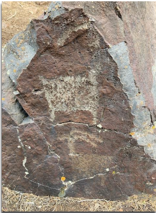
Beaver area petroglyphs