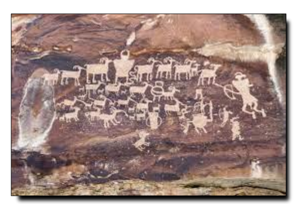
Great Hunt Panel, Nine Mile Canyon