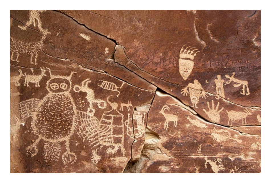
Owl Panel, Nine-Mile Canyon

So, Save the dates and watch for more information. If you are not currently a member of URARA, which you would need to be to sign up for field trips, you can join on our website <a href="https://www.utahrockart.org">www.utahrockart.org</a>, for $25 single, $30 a family.