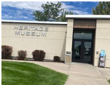
Uintah County Heritage Museum, 155 East Main, Vernal, UT