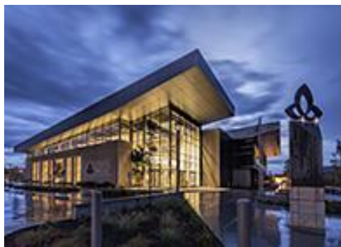
Uintah Conference Center, 313 East 200 South, Vernal, UT

Registration for the 2022 symposium is now open on the URARA website. Go to the website for details. This is an overview of the symposium venues and activities.