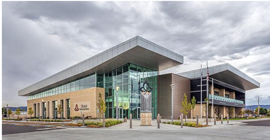
Uintah Conference Center