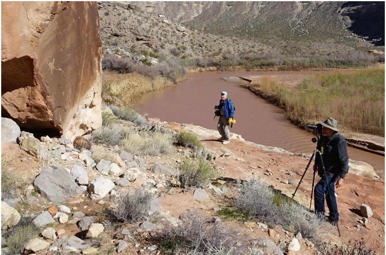
Diving for fish on the Virgin River