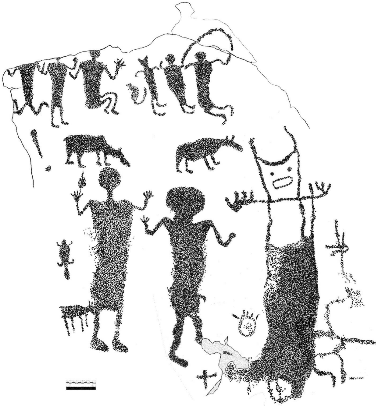
Rocky Ridge, Utah