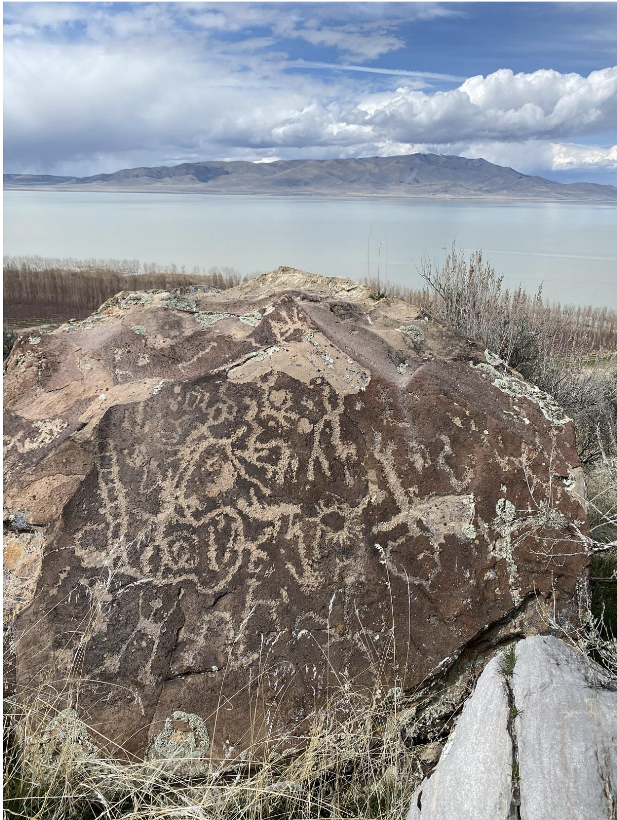
West Mountain Petroglyphs