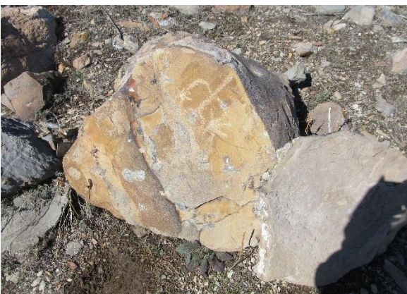
↑ Impacts to rock art from bullets ↑