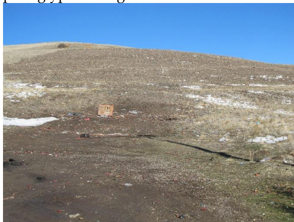
Shooting lane with hillside of rock art boulders behind

This past month, as an official Site Steward through the Salt Lake field office of the BLM, I visited my assigned site to create a site map and get a baseline of conditions there. My site is located above a target shooting lane where 22 boulders that we have found so far are located. As with Lake Mountain until the closure to target shooting, this area suffers from excessive trigger trash and large target debris as well as damage, vandalism, and theft of the rock art. Unfortunately, the petroglyphs are again located on boulders. The following pictures document a bit of what I found.