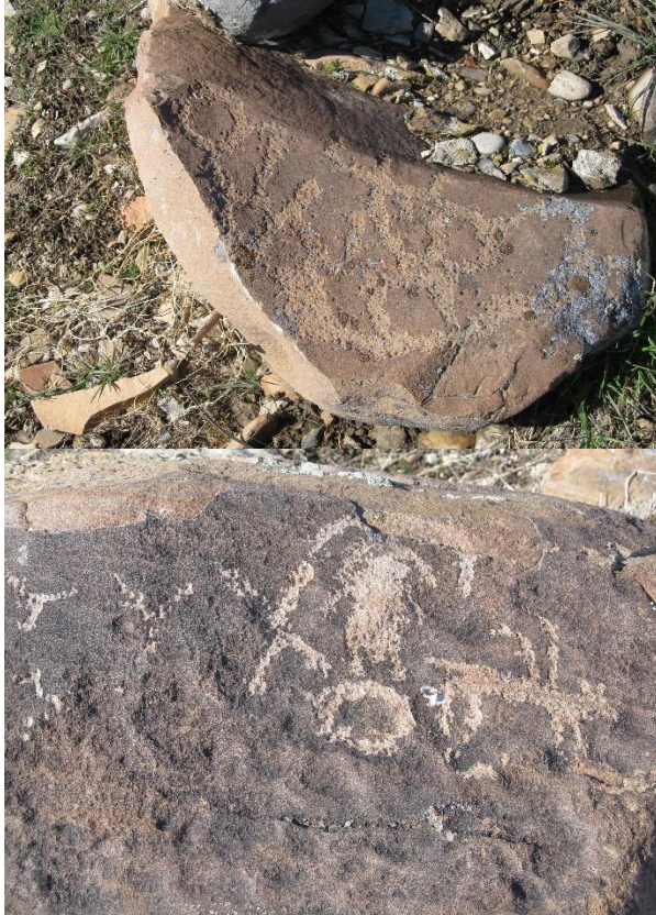
Easy to see or hard to see, it's there!