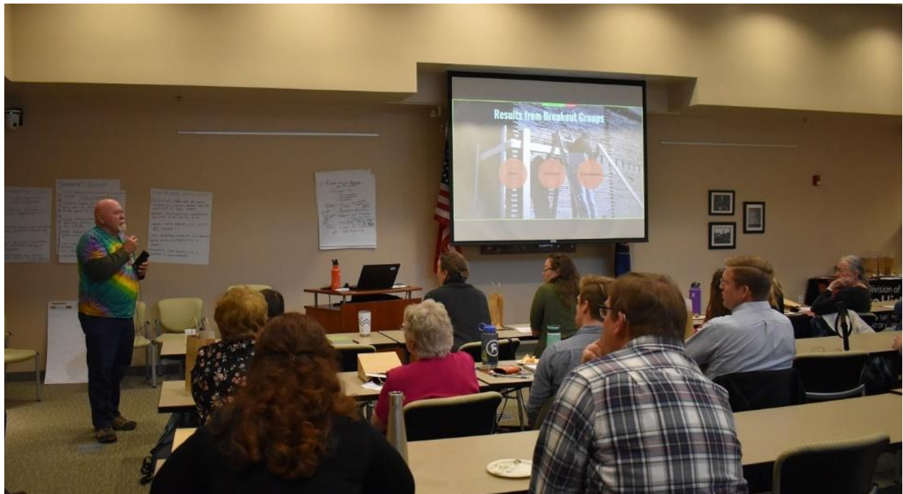
UtahPAN inaugural meeting January 24, 2020

https://www.academia.edu/35696390/A_SPATIAL_AND_STYLISTIC_ANALYSIS_OF_CUP_AND_CHANNEL_PETROGLYPHS_FROM_THE_ARIZONA_STRIP?email_work_card=title