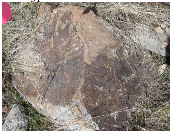
Typical boulder site for the area