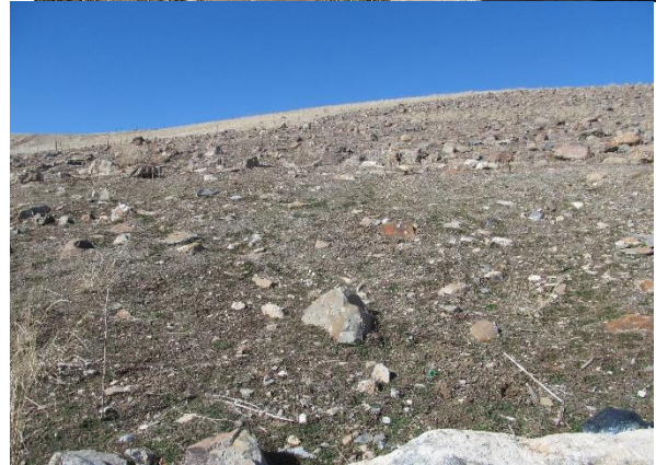
The sites are in a approx. 300' area on this boulder slope

My plea to you is, share your knowledge of why it's important to protect and preserve these irreplaceable cultural resources. With it disappearing at a faster rate all the time, we need to do our part to educate our family, friends, and people we meet along the way, to respect and protect these amazing writings, art, cultural heritage, and subjects of our imagination. Everyone a Steward!