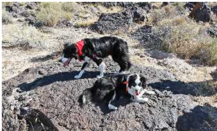
Tweed and Bella on the rocks at Black Ridge - David Sucec