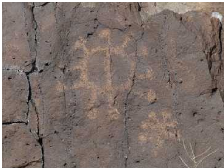
Somewhere near Delta, Utah

Southern Nevada Rock Art Association (SNRAA) meets on the 4 th Monday of the month; See http://snraa.org/snraa.org/EVENTS.html