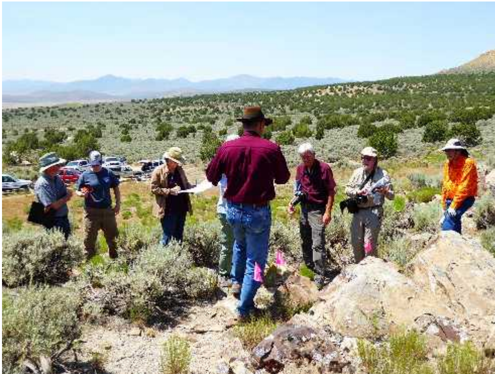
BLM Resource Advisory Council meeting at Lake Mountain