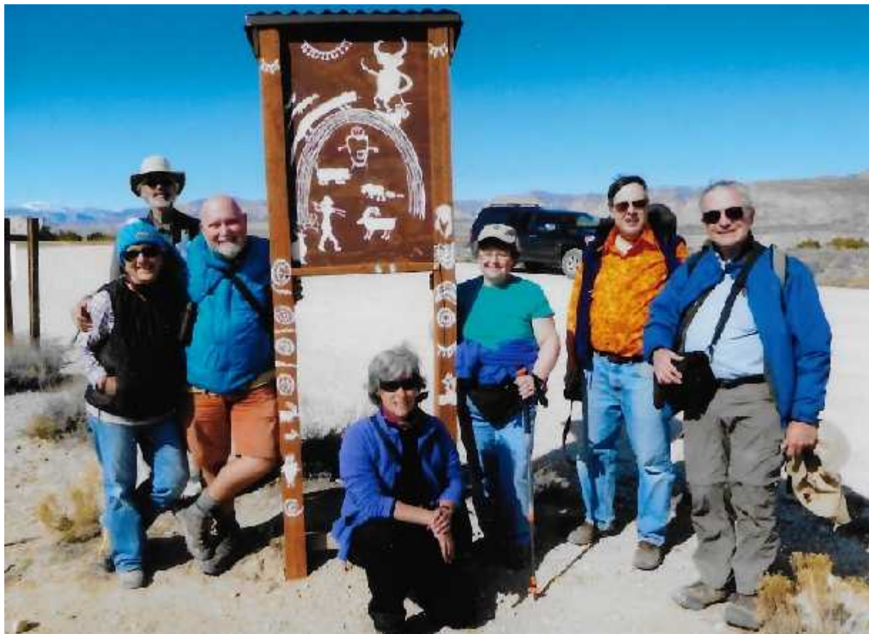
At Rochester Creek sign

At Mussentuchit, besides petroglyphs, is an intaglio and an historic inscription (Mayhew pioneers to the Dirty Devil). Since last visited in 2001, half the inscription has fallen off.