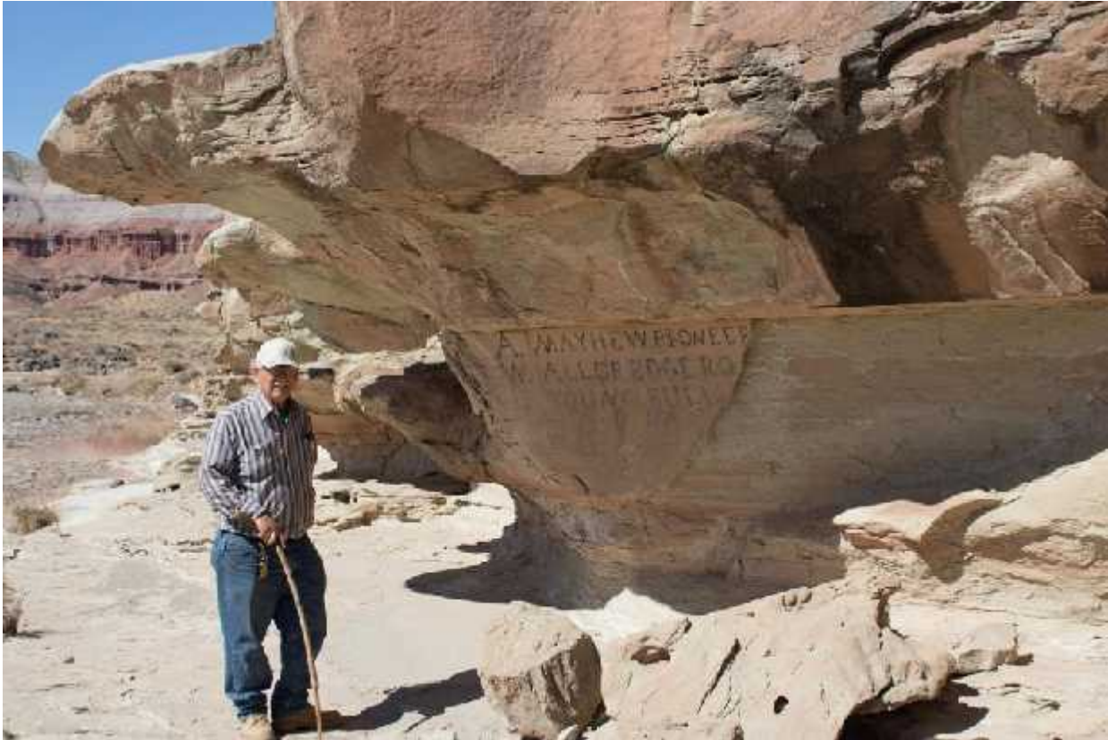
Mayhew inscription, March 20, 2016