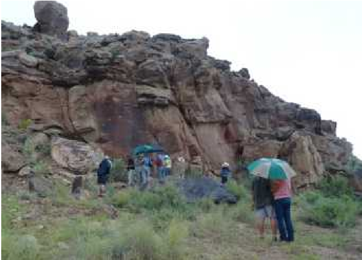
Rockart'n in the rain, 2015 summer picnic - Ben Everitt

In addition to the options above, camping is available on surrounding BLM lands in any area that is already disturbed. There are also many houses available for short-term rental. Real estate agent Leslie Venuti (435-668-0540) can inform you regarding availability of rentals and help you make arrangements.