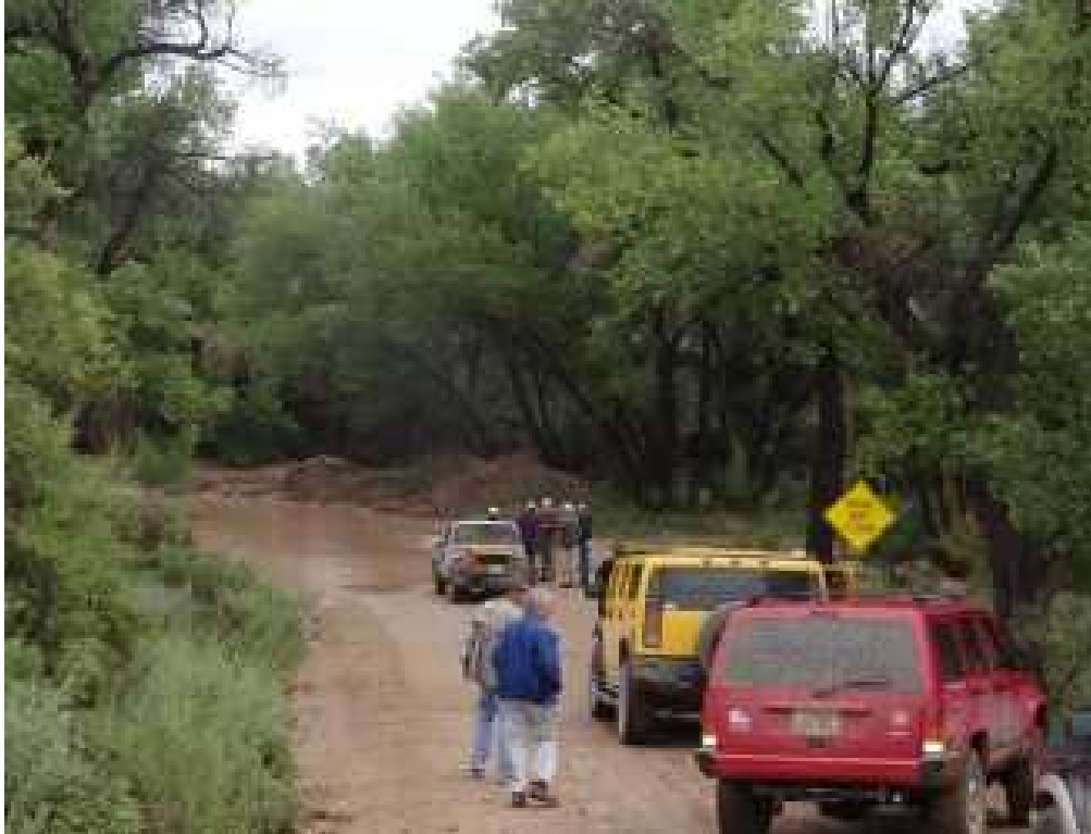
Inspecting Montezuma Creek