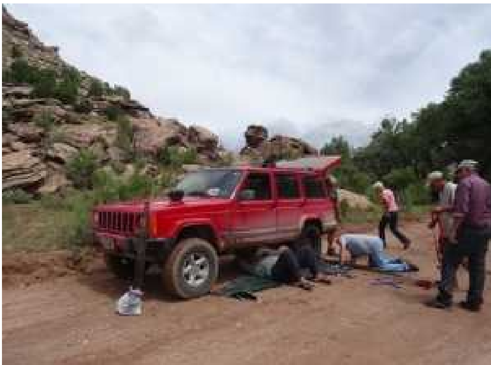
Inspecting the suspension