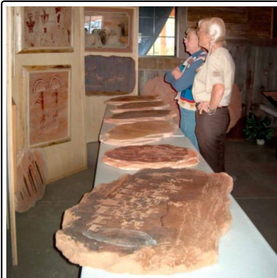
The lecture hall at the symposium was lined with numerous tables filled with interesting items from vendors, like these rock art replicas.

Native Americans, archaeologists, rock art advocates, and the American Public will all have a deep interest in the inherent value of protecting these irreplaceable resources.