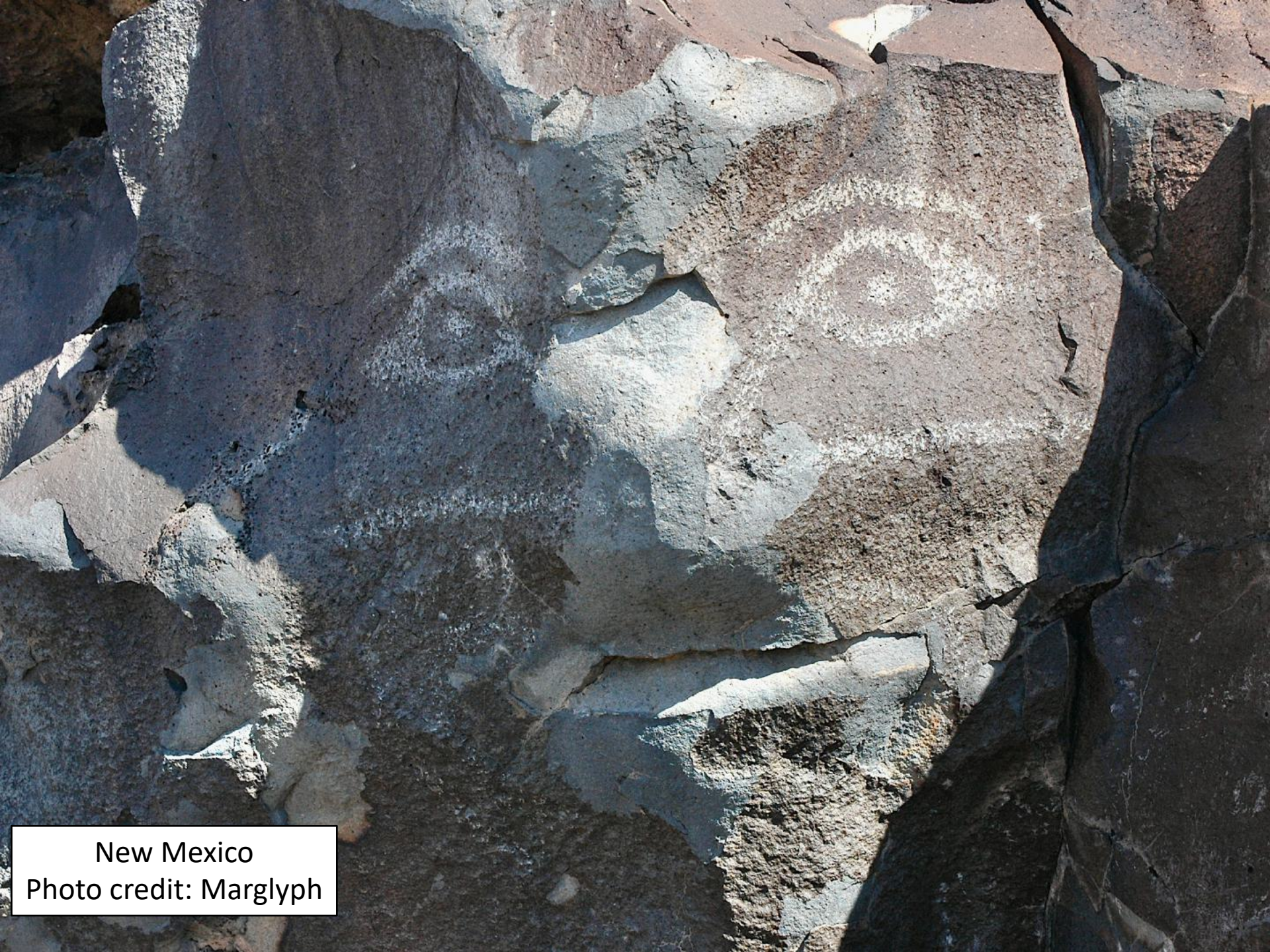
New Mexico