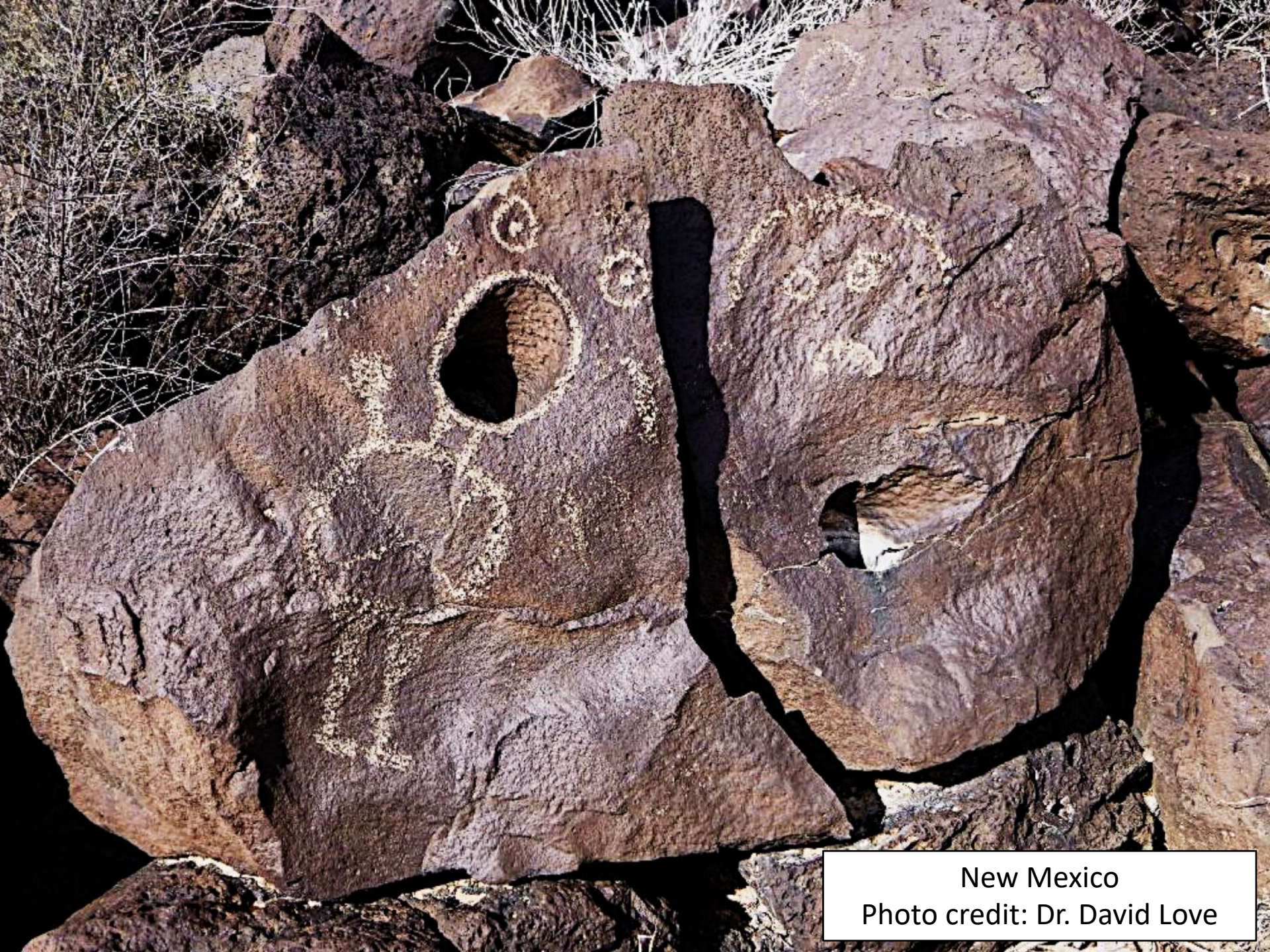
New Mexico